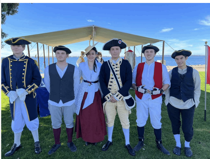
above Younger members, CAR, scouts and sea cadets.