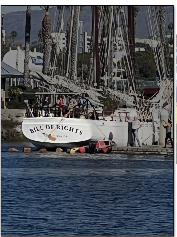
Left Another box of tea goes over the rail of the "Bill or Rights".