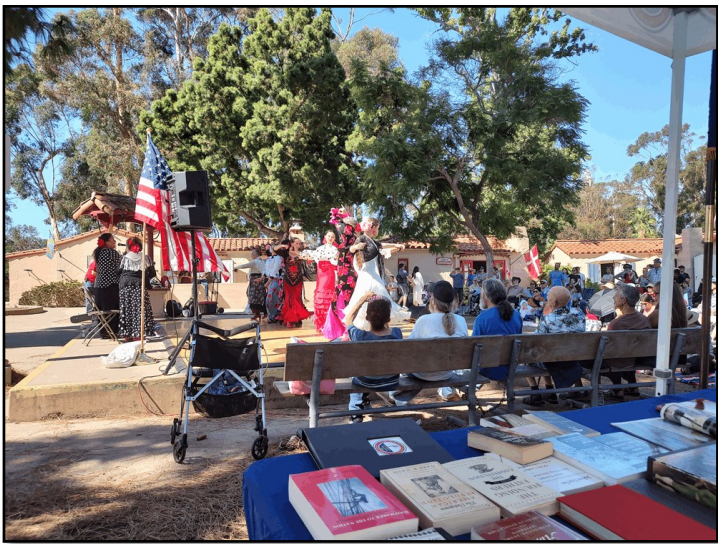
Left- Spanish Flamingo Dancers on the Lawn Stage.

The traffic through the booth was small compared to other years and events, but we had about eight solid membership inquiries with several stating that they had close relatives which were already DAR members, or that they have already done the research. We had several conversations regarding America 250 and of course posed for many pictures.