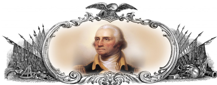
Dinner in honor of His Excellency General George Washington's 291st Birthday 25 February 2023 AD At the Green Dragon Tavern—Carlsbad, Ca.

Signup and meal selection is now active for our biggest event of the year, the George Washington's Birthday Black-Tie dinner.